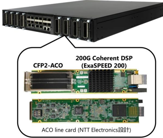
Fig. 1 Transponder with CFP2-ACO transceivers.

The ROADMS are Lumentum ROADM-20 white boxes that expose a Netconf API described by a Yang model provided with the device [9]. The Transponders Client ports have emulated end-hosts to generate traffic and measure network state.